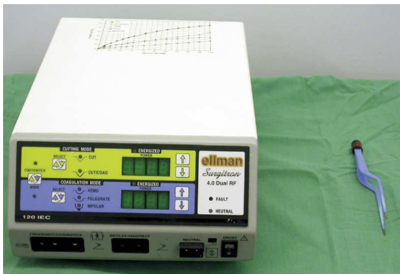
Figure 1 The radiofrequency apparatus and the bipolar forceps.

polar radiofrequency dissection tonsillectomy (BRDT) to cold dissection tonsillectomy (CDT) regarding intra-operative blood loss, operative time, postoperative pain, and postoperative complications including hemorrhage.